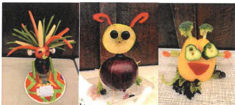
Here are some of the fantastic entries for the 'Harvest Creature' competition.