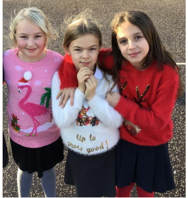
Lots of happy faces from our Christmas Jumper day!