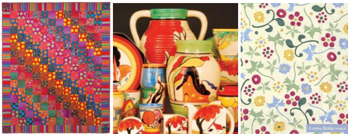
Patterns by Kaffe Fasset, Clarice Cliff & Emma Bridgewater.